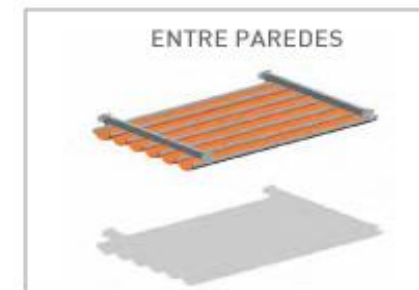
TABELA - PERGOLA ELIT ENTRE PAREDES STD