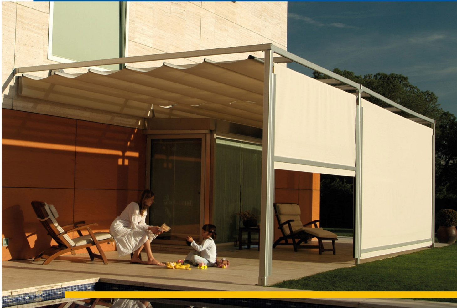
TABELA DE PREÇOS